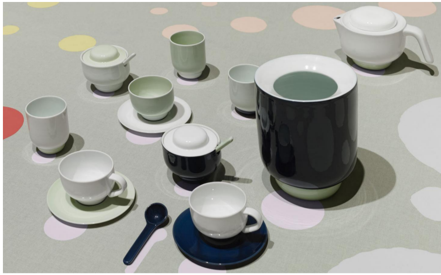
'Bonhomie' tea set collection created with Arita