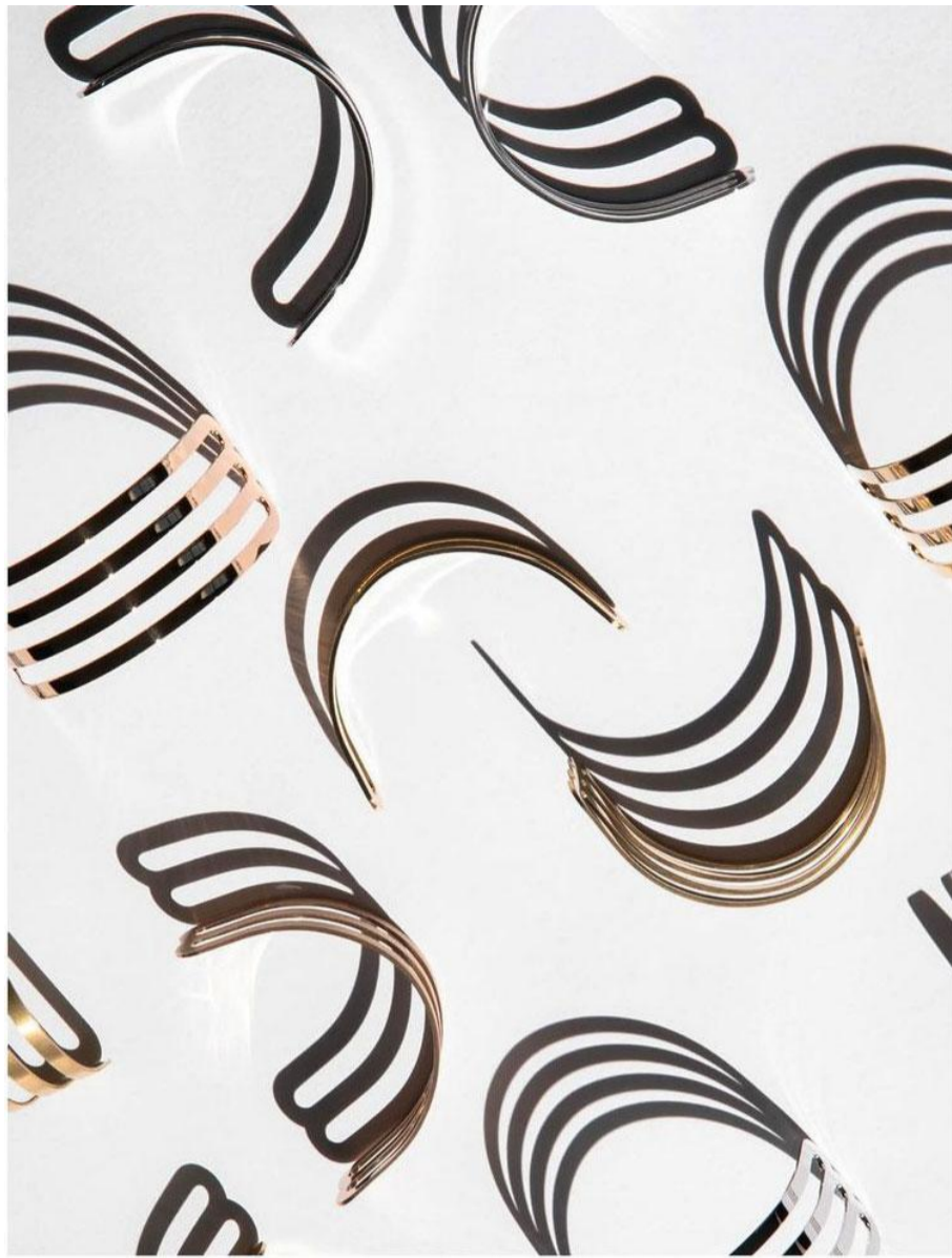
'Éteintes' bracelets for Jem Jewellery