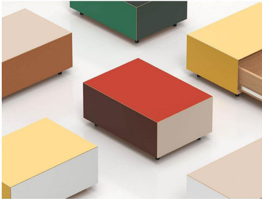
'Bloc' coffee tables for Established & Sons