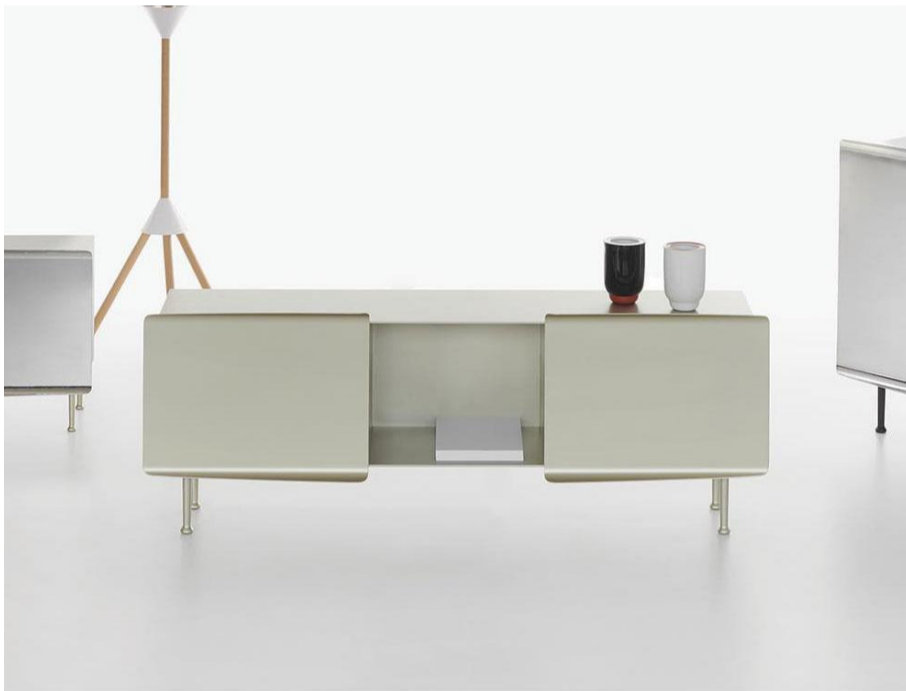
'356' collection for Fucina